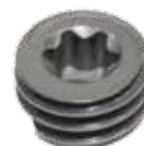
Setscrew III (Titanium)